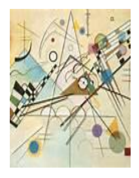
Kandinsky, Composition #8

Summary : Visual arts students integrate studies to create dynamic artworks for an original exhibition that demonstrates influences among the arts, and informs in-depth connections with Kandinsky's artistic influences and how his goals and style changed over time.