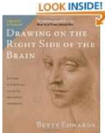
Drawing on the Right Side of the Brain: The Definitive, 4th Edition by Betty Edwards